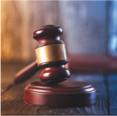
The eight former Indian Navy personnel were employees of Dahra Global Technologies and Consultancy Services, a private firm providing training and related services to Qatar’s armed forces

According to the company’s website, its core area of business focuses on defence services and includes procurement and